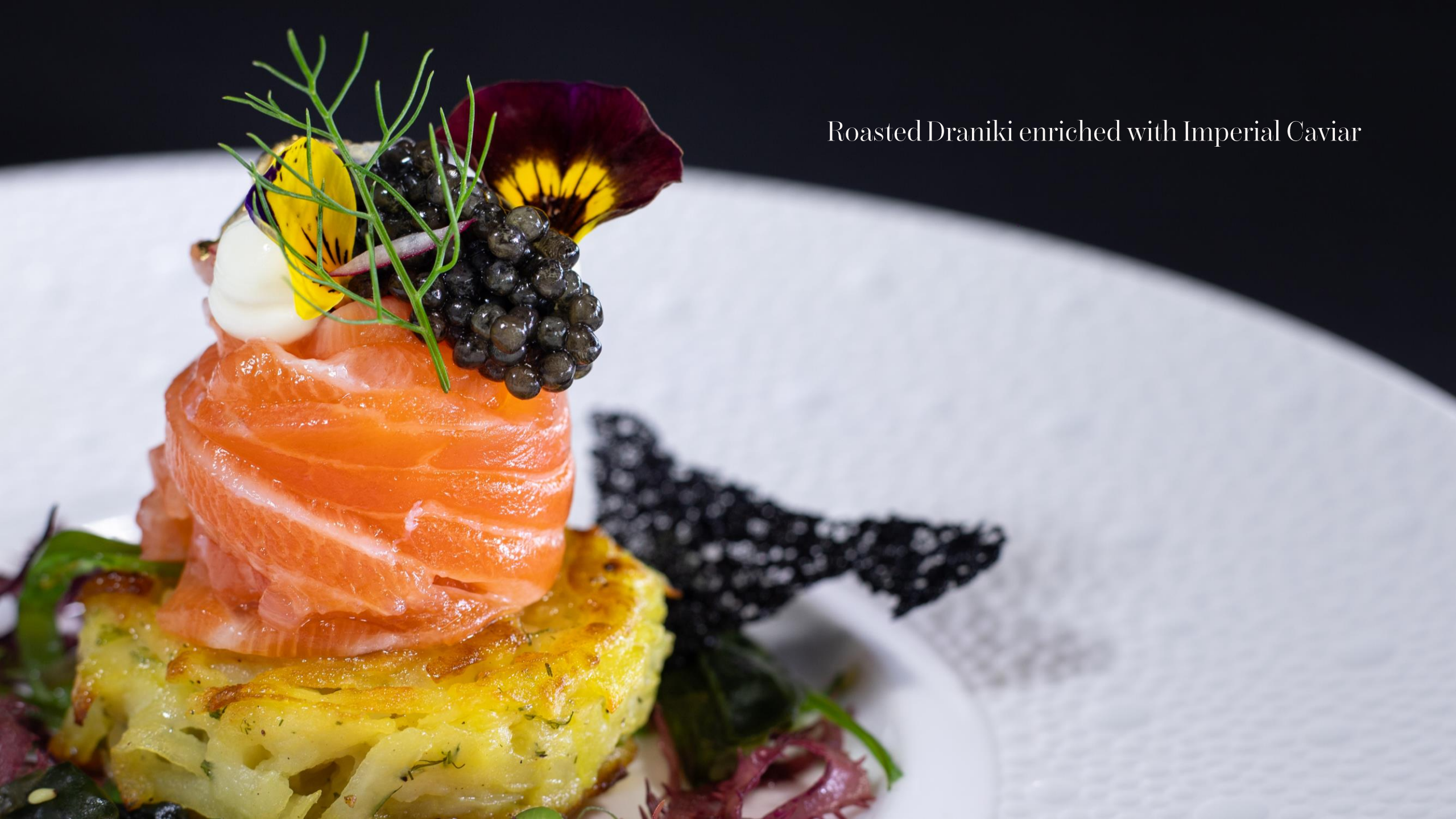
Roasted Draniki enriched with Imperial Caviar