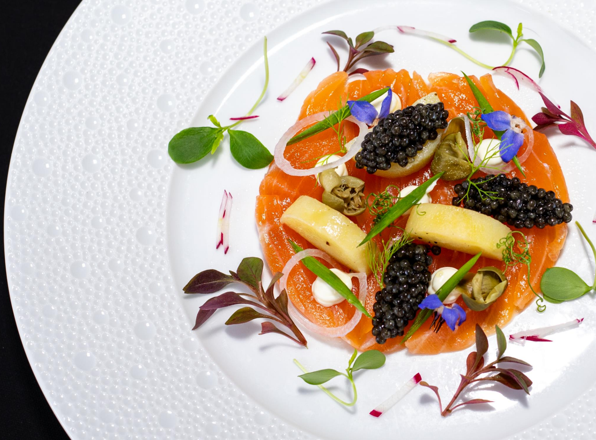
Steamed Spanish Ratte Mini-potato with Royal caviar