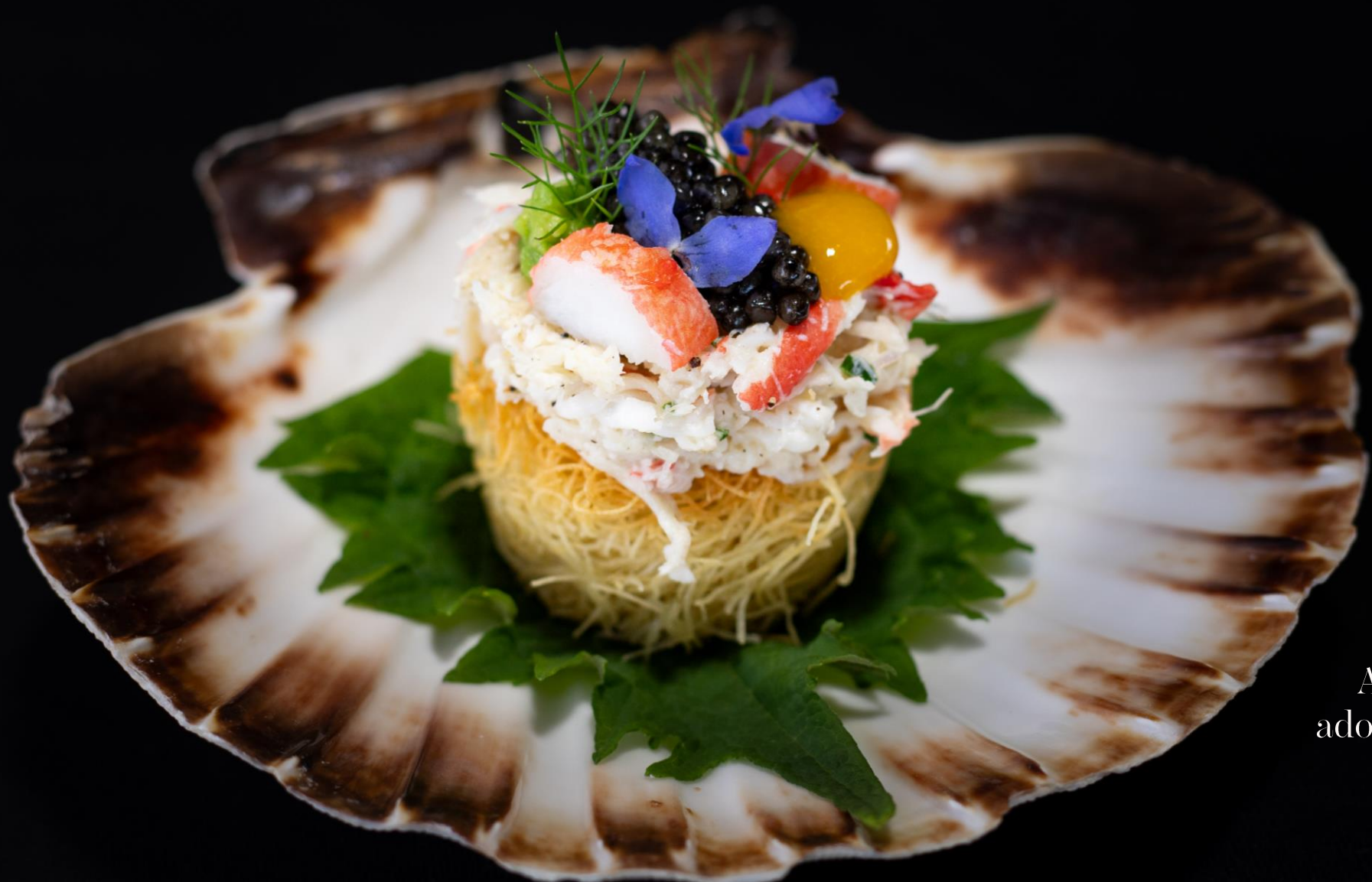
A savoury Greek Kataifi adorned with Imperial caviar