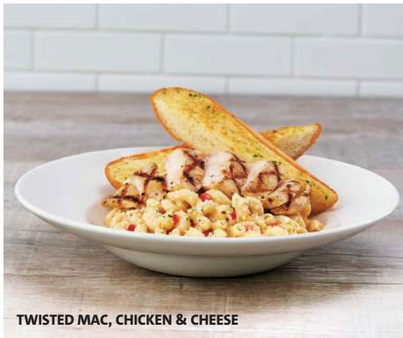
TWISTED MAC, CHICKEN & CHEESE