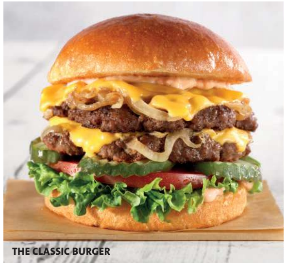
THE CLASSIC BURGER