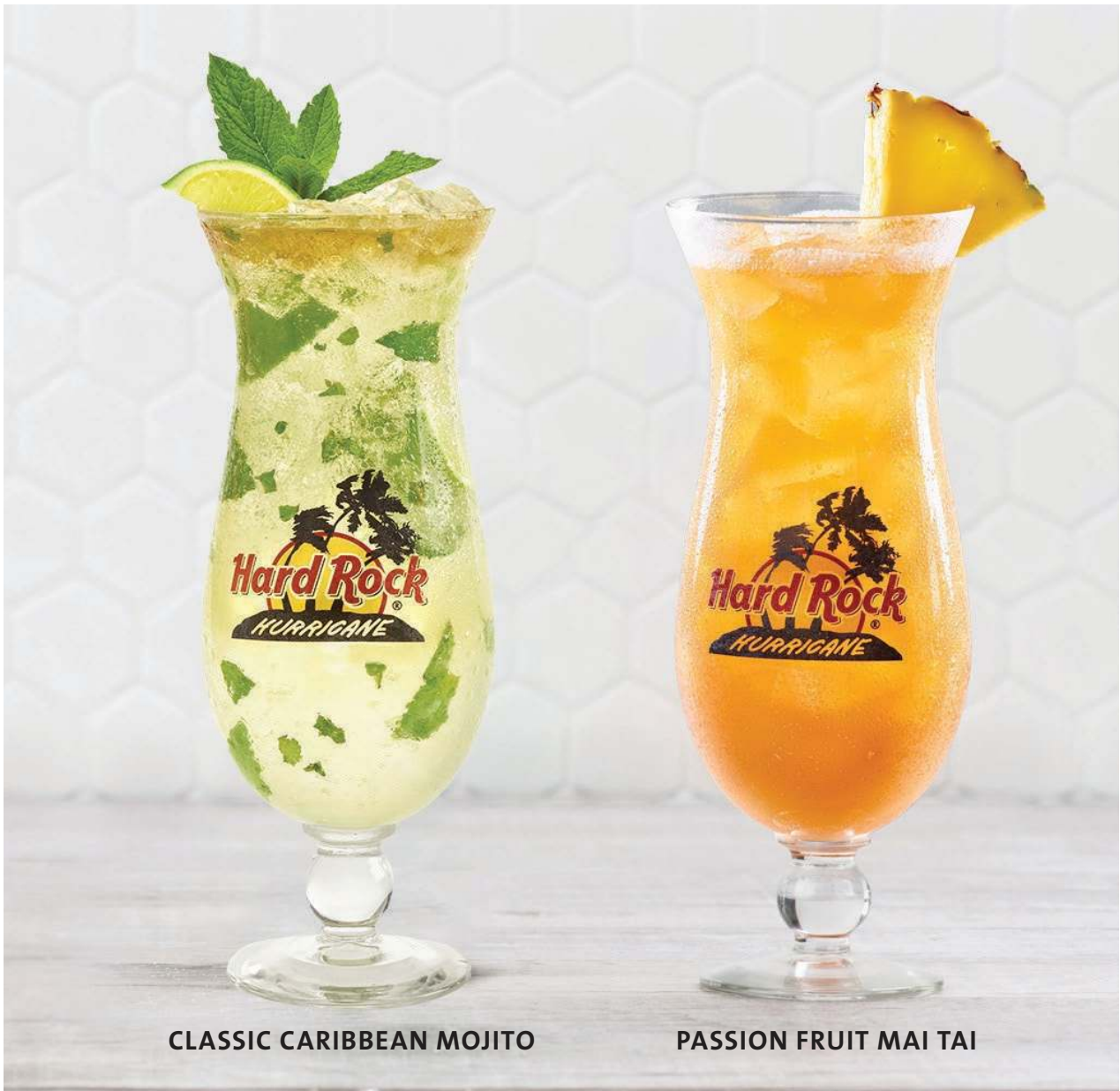
CLASSIC CARIBBEAN MOJITO