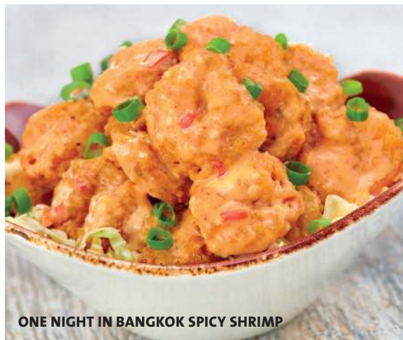
ONE NIGHT IN BANGKOK SPICY SHRIMP