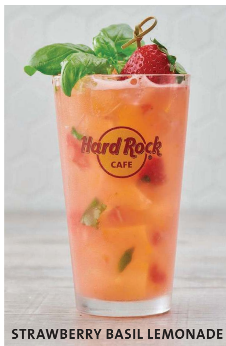
STRAWBERRY BASIL LEMONADE

PROUDLY SERVING Coca-Cola PRODUCTS AND THE FOLLOWING BEVERAGES $6 Coca-Cola, Coca-Cola Zero Sugar, Diet Coke, Sprite, Fanta Orange, Ginger Ale, Ginger Beer, Tonic Water