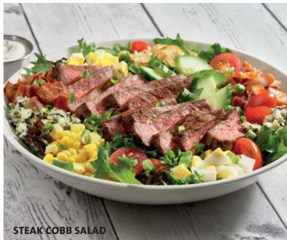
STEAK COBB SALAD