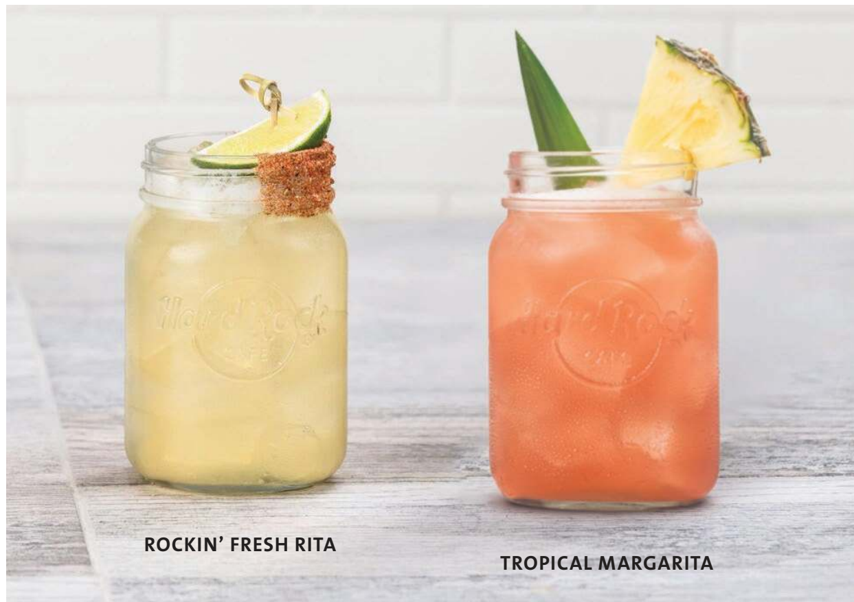
ROCKIN' FRESH RITA

Smirnoff Vodka, Bacardi Superior Rum, Beefeater Gin and Blue Curaçao with sweet & sour and topped with Red Bull®. 16 oz US$ 13 | 24 oz US$ 17