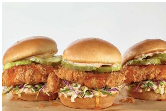
FRIED CHICKEN SLIDERS