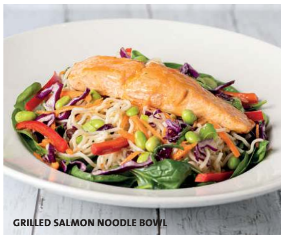
GRILLED SALMON NOODLE BOWL