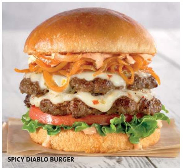
SPICY DIABLO BURGER