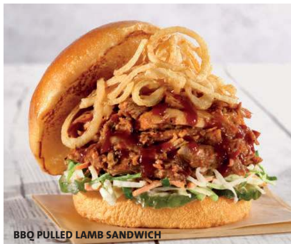
BBQ PULLED LAMB SANDWICH

Grilled fresh chicken with melted Monterey Jack cheese, smoked Turkey bacon, leaf lettuce and vine-ripened tomato, served on a fresh toasted bun with honey mustard sauce. $22