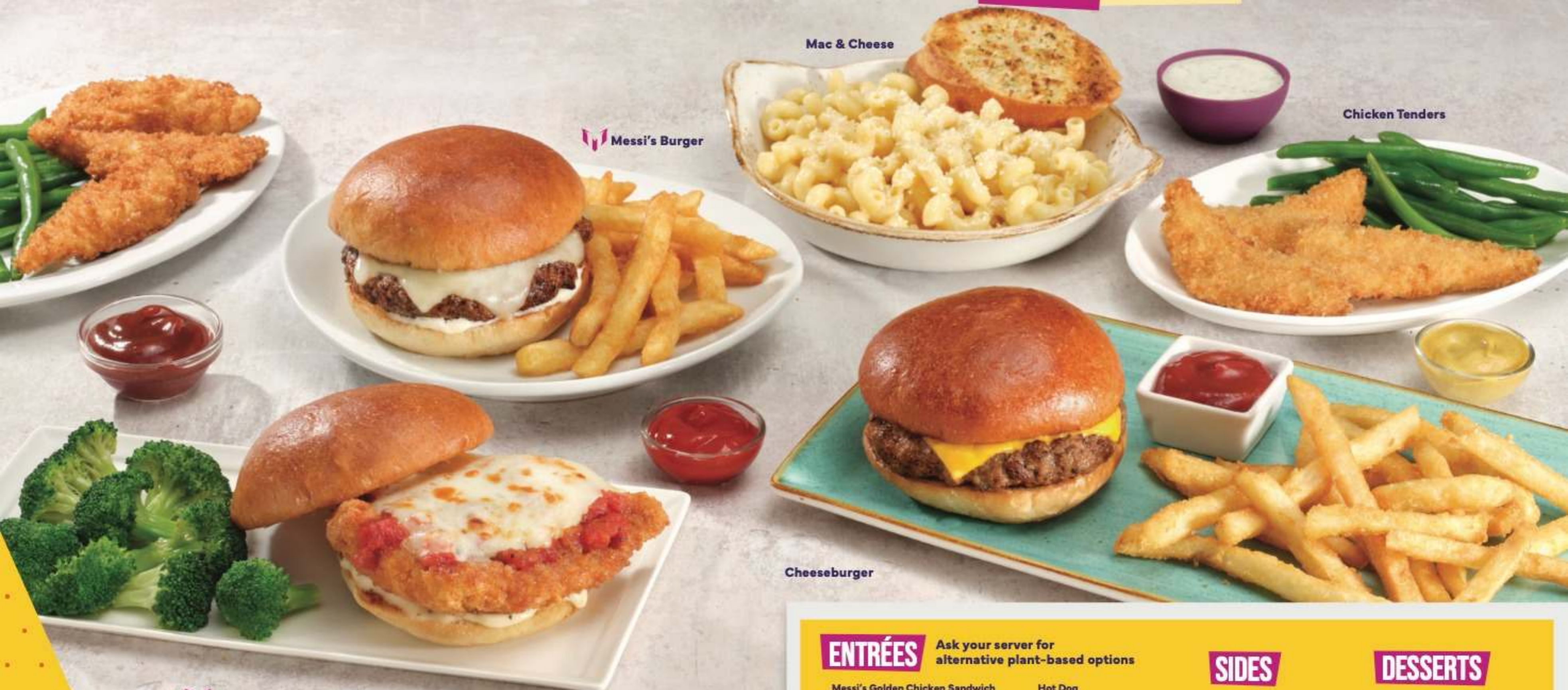
Messi's Golden Chicken Sandwich