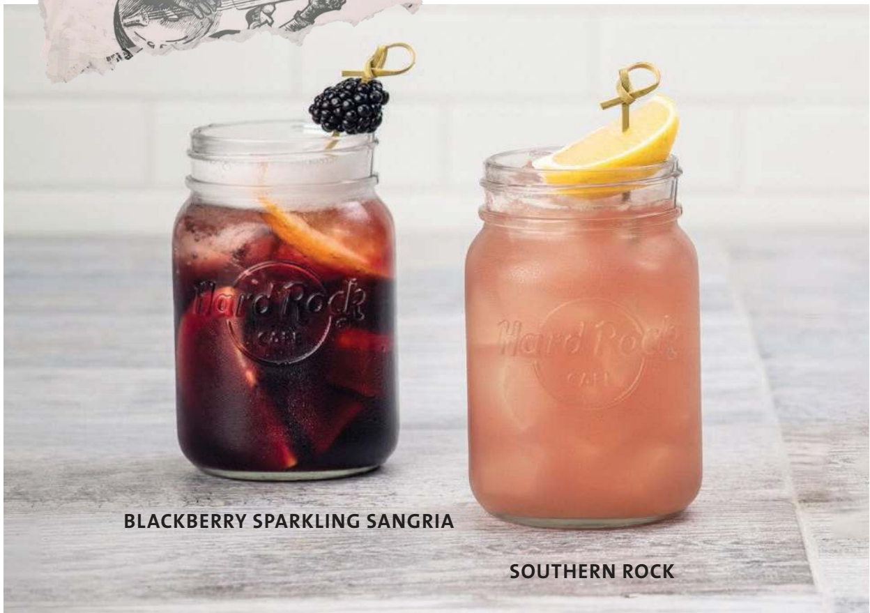
BLACKBERRY SPARKLING SANGRIA